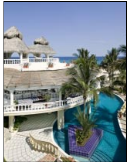
Restaurant and pool at the Marbella Suites Hotel.