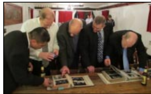
Alumni enjoyed looking through old photo albums and reminiscing at the Open House.

Before the dinner, alums and parents walked with the undergraduates from the House to the Faculty Club. Again, there was no guest speaker to allow more time for everyone to mix, mingle, and socialize. Sixty monetary award scholarships were announced — fifty from the Scholarship Fund, and ten from the Wineman Challenge (see Scholarships, page 3). A before-dinner auction raised $1,000 to help the Seattle Alumni Association fund other events. Special thanks to alums who donated items,