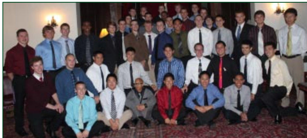
The brothers of Washington Alpha Chapter of Phi Kappa Psi